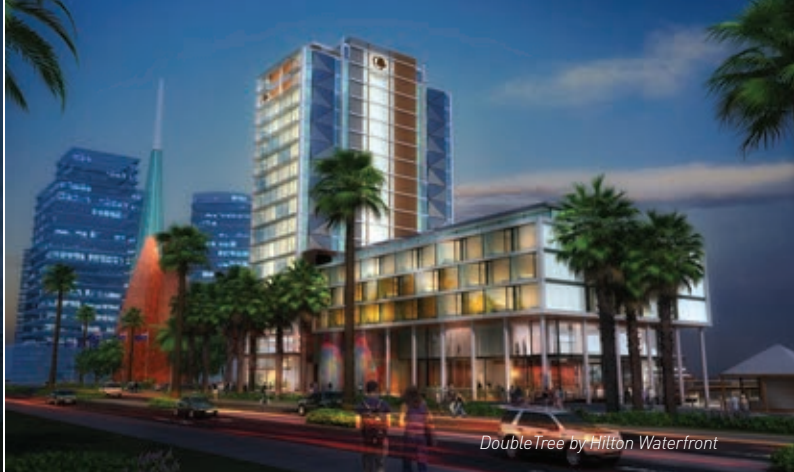
DoubleTree by Hilton Waterfront