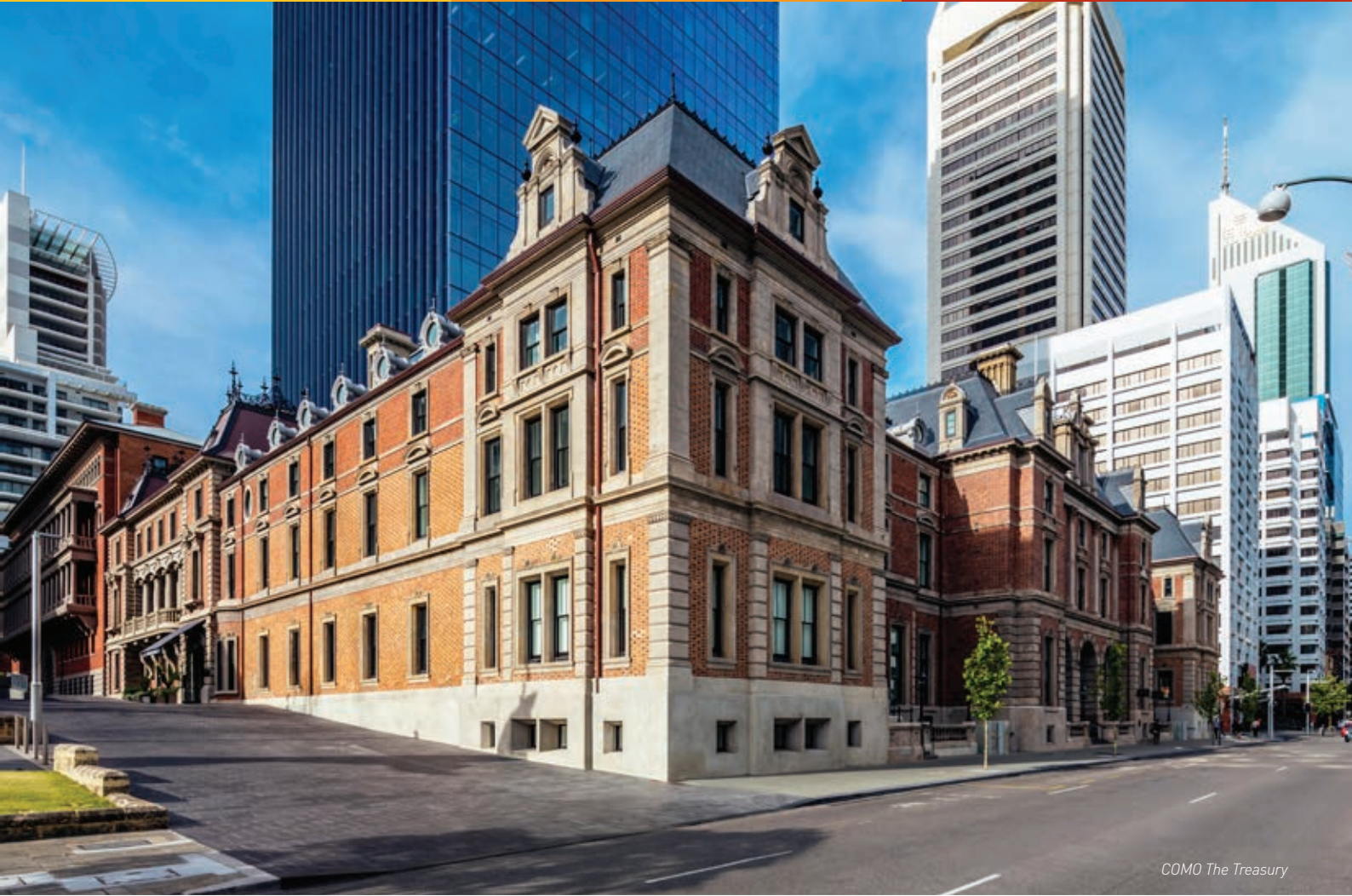
COMO The Treasury