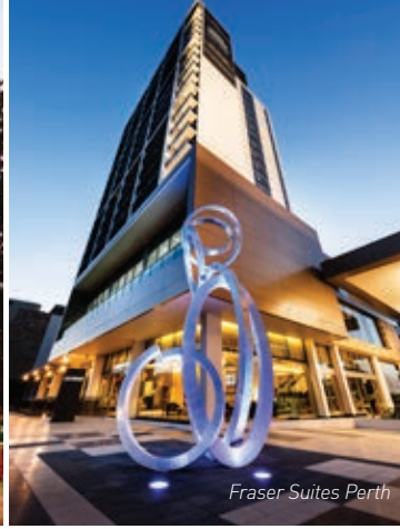
Fraser Suites Perth