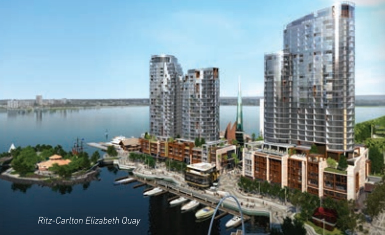
Ritz-Carlton Elizabeth Quay