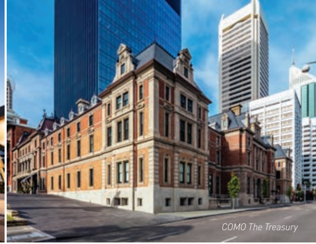
COMO The Treasury